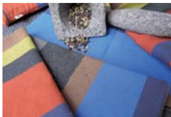
Lons kitchen towels