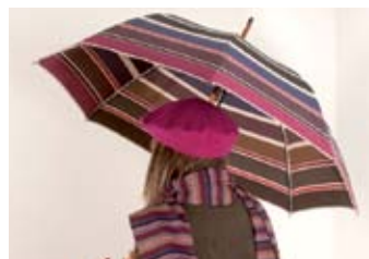
Umbrella and scarf