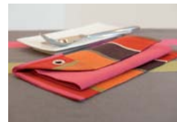
Ogeu napkin pocket