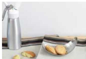
Mauléon gris napkins