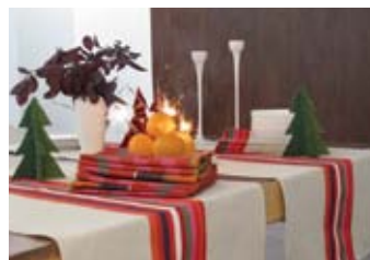
Mauléon rouge runners