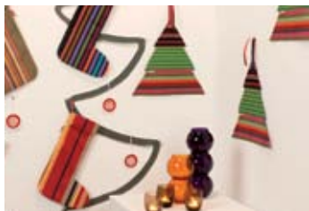
Fir tree to be hung