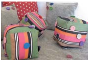
Canvas fabric dice