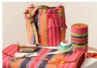
Bag to be customised