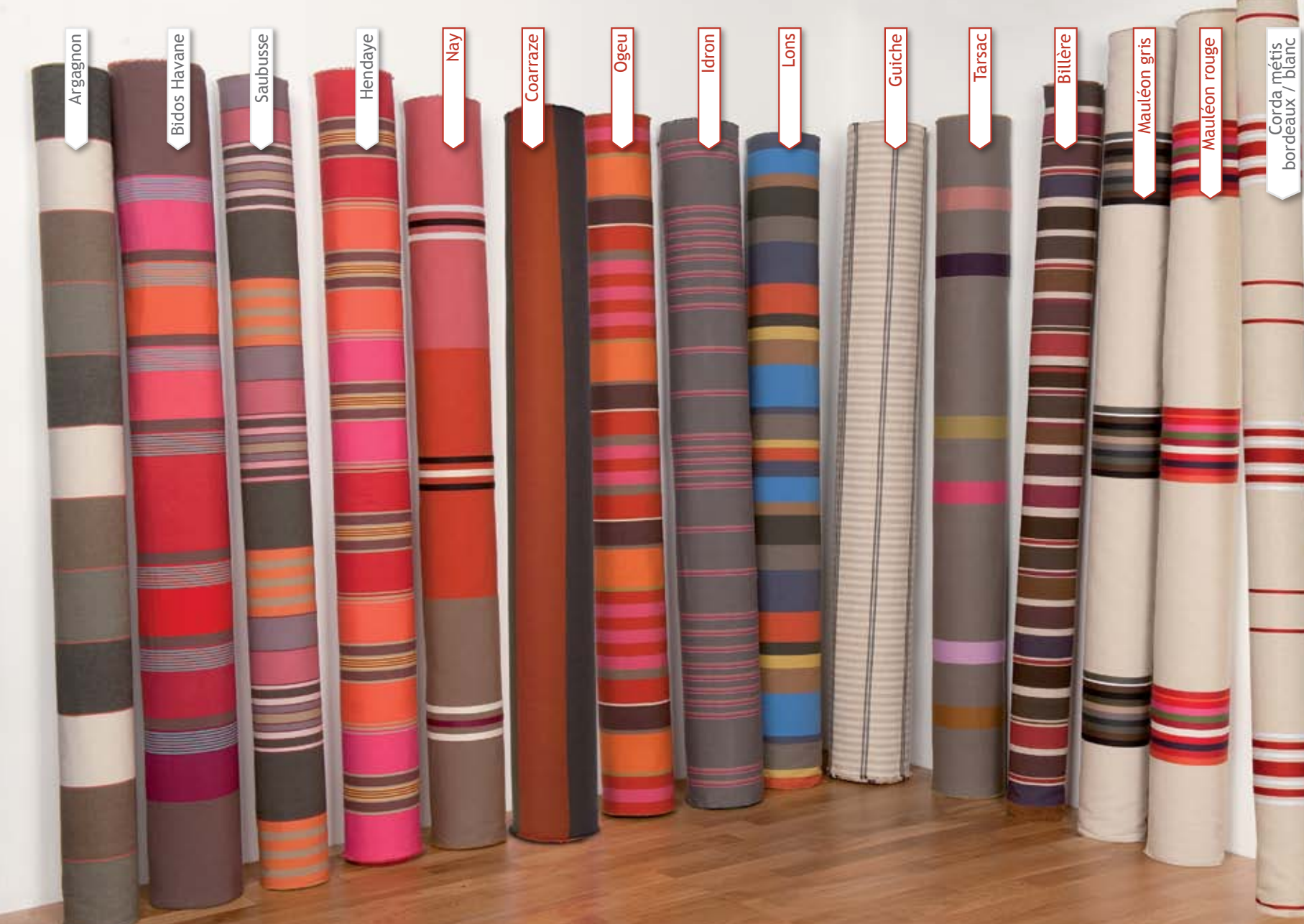
Corda métis bordeaux / blanc