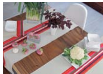
Mauléon rouge runners