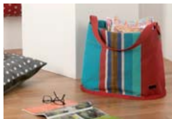
Ciboure all-purpose bag