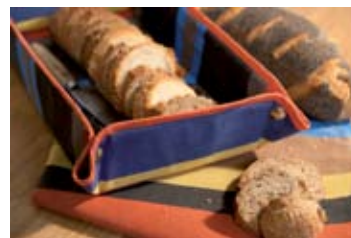
Rectangular basket Lons